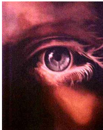
"EYE SEE YOU" Item # DF-CNVEYE-5001