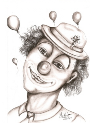
"A CLOWN IN-LOVE" Item # DF-CNVCIL-3001