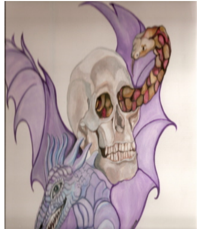
"BONES :: SEPARATION" Item # DF-CNVB-SEP-6001

More beautiful artwork of Gigi S. Vaughan will be available on our website each month. Be sure to revisit us to see all the new pieces.