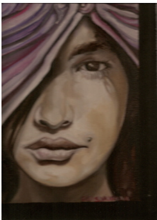
"THE AMETHYST" Item # DF-CNVAMTH-4001